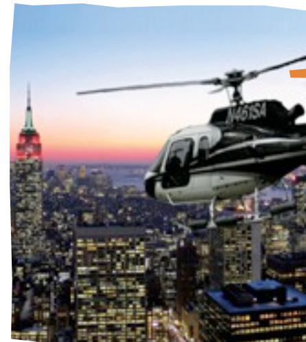
NYC by helicopter